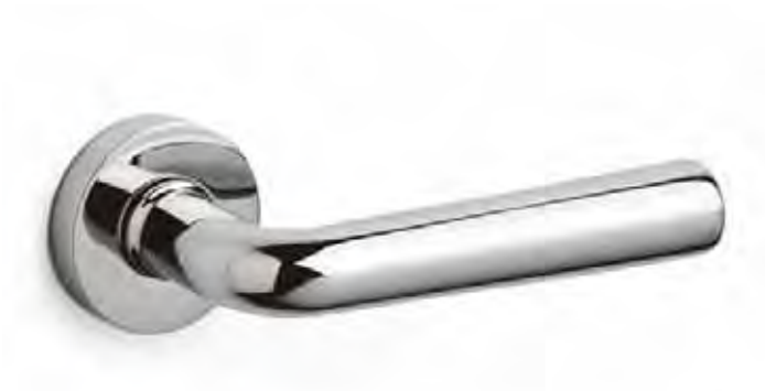
Garda - M118