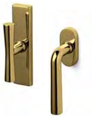
C105R - fixed window slider