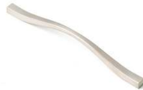
Dull Brushed Nickel